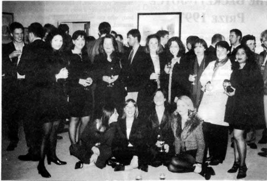
Portora Old (!) Girls