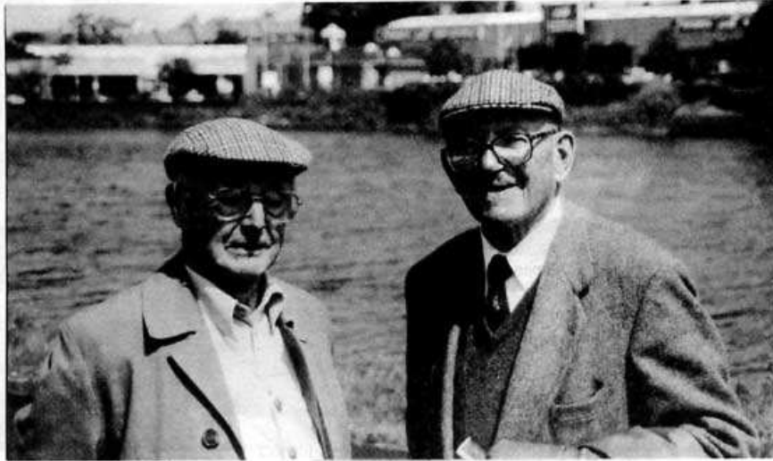
117 Years of Irish Rowing